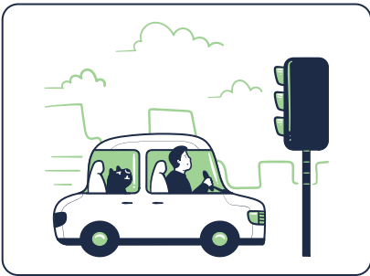
He is driving.

Look at the people below. What are they doing? Create sentences with the correct use of the present continuous tense.